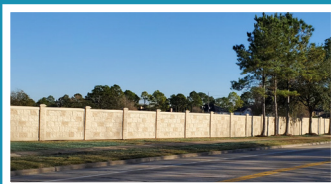
Light Brick Perimeter Fencing