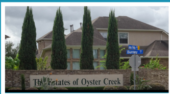
Neighborhood Entryway Signage